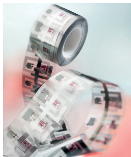
Fig. 1. Printed interactive optical labels (smart labels) from the roll

The term “printed smart objects” means a combination of various printed electronic components, such as input elements (switches), displays, energy sources