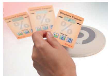
Fig. 6. A previously undisclosed discount or prize is shown by radio-activated prize draw tickets

dications) are generated that have strong differences in their absorption behavior. An electrochromic polymer that is well known to the experts is, for example, the PEDOT/PSS system, i.e. poly(3,4-ethylenedioxythiophene)/poly(styrene sulfonate), which can be switched between weak light blue and deep dark blue by changing its oxidation state [4].