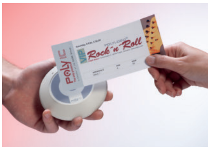
Fig. 4. Radio-activated smart tickets provide automatic admission