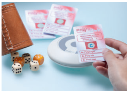
Fig. 5. Radio-activated playing cards give an answer immediately