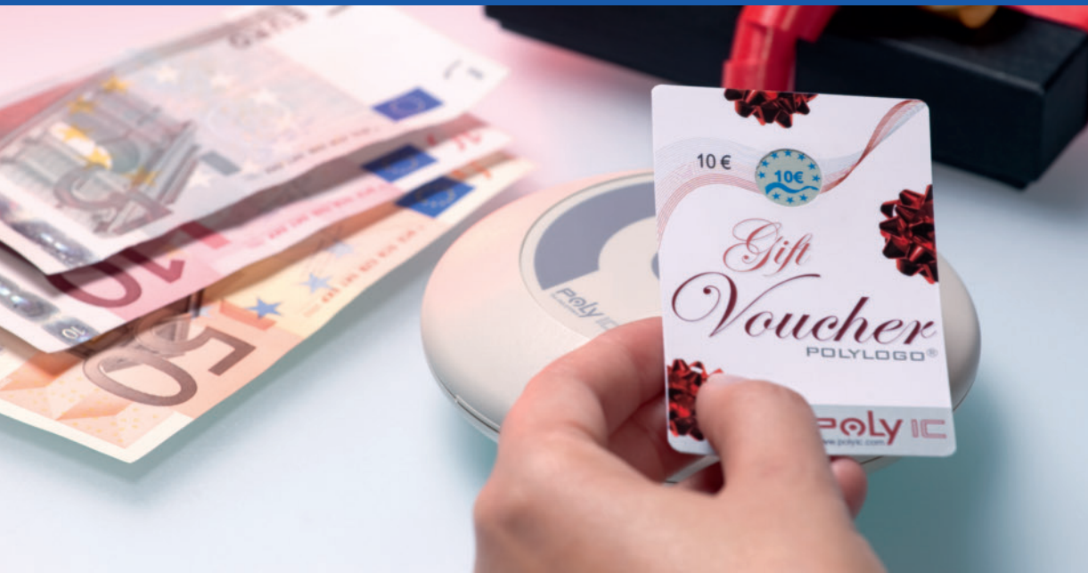
Printed smart card as gift voucher (figures: PolyIC)